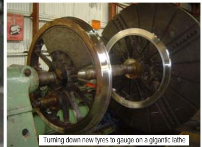
Turning down new tyres to gauge on a gigantic lathe