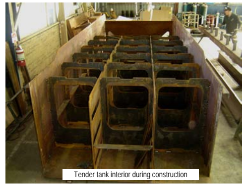
Tender tank interior during construction