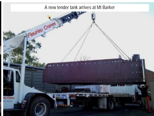
A new tender tank arrives at Mt Barker