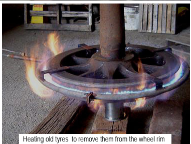
Heating old tyres to remove them from the wheel rim